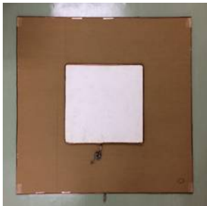
Figure 3 Transmitting loop and receiving coil.

The power transmission coil is a 90cm sided square loop made with copper wire of 2 mm diameter. The receiving coil is a two - turn square coil of 55 × 40cm. A resonant capacitor and a balun for balanced - unbalanced conversion are connected to the coils. The distance from the transmitting to the receiving coil is 15 cm. If the receiving coil is located fully inside the area of the transmitting coil, the transmission efficiency is 90% or more. Figure 3 shows a transmitting and a receiving coil.