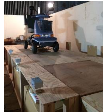
Fig. 2 WPT system for traveling mobility scooter.

Figure 1 shows the configuration of the developed system. The transmitting coils are embedded side by side along the traveling path where the mobility scooter passes over which the scooter is passing at the moment. Electric power from the high frequency power source is only supplied to the coil upon which the scooter is passing at the moment. To detect the position of the vehicle, ultrasonic sensors are installed on the roadside at every transmitting coil. The active transmitting coil is selected by the coaxial switch provided on the transmission side.