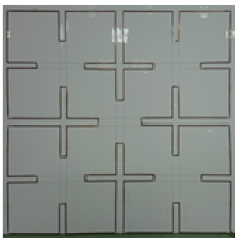
Fig.4 Fractal loop and matching circuit

We use the same loop as the transmitting and receiving coil. Its side is 70cm. In the design, the transmission efficiency of the shape was calculated, keeping the loop distance constant and increasing the horizontal displacement between coils from 0% (complete alignment) to 100% (non-overlapping). The shape was designed so as to maintain high values of efficiency by Genetic algorithm. When the relative positions of the loops vary, a variable matching circuit would be required. However, it is difficult to obtain variable matching circuits at high power. Therefore, we used a fixed matching circuit whose parameters were chosen for high average power efficiency. The optimal component values of the matching circuit were decided using the pattern search function. A photograph of the fractal loop are shown in figure 4.