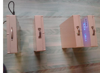
FIG.2 THE WPT SYSTEM SEALED BY ABS BOXES

coupling can be protected by sealed with ABS material without much change of performances. Experiments have been carried out to verify the studies above by using a four coil WPT system via magnetic resonance coupling, as shown in Fig. 2. The four coils of the WPT system via magnetic resonance coupling are sealed in ABS boxes. The LEDs are lighted with a little brightness change through the WPT system via magnetic resonance. The phenomenons proved that there are a little seal impacts of ABS boxes on the efficiencies and resonant frequencies of the WPT systems via magnetic resonance coupling.