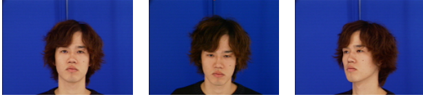
Figure 3: HOIP database image

Japan [12]. The subject images comprised people with a wide range of ages. The background was made the same for all subjects. Furthermore, facial expression is neutral. Moreover, there are facial images of which it takes a picture from various directions. In this paper, the face database was used with permission from Softopia corporation, Japan. It is prohibited to copy, to use, and to distribute the images without the authorization of the copyright holder.