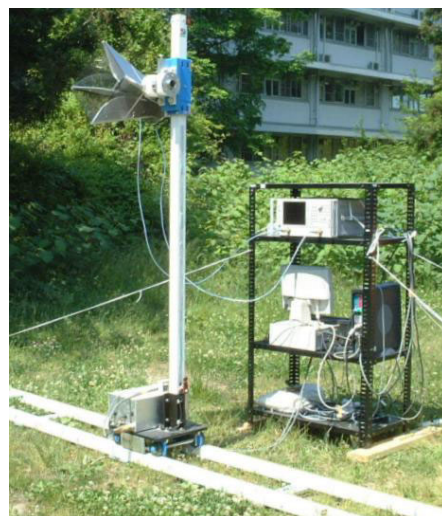
Fig. 1 A developed polarimetric GB-SAR system

A modified polarimetric Radar Cross Section (RCS) calibration technique using two orientations of the dihedral corner reflectors as calibration targets is introduced [6, 7]. This method is valid for any monostatic or quasi-monostatic radar system. From the theoretical value of two calibrators and measured data, we can recover calibration coefficients. With the use of the calibration coefficients, the auto-calibrated results are presented in Table 1 resulting in observable improvements after calibration, especially in the phase term. Although neglecting effects of noise in the calibration measurement, desired improvements due to calibration have been achieved.