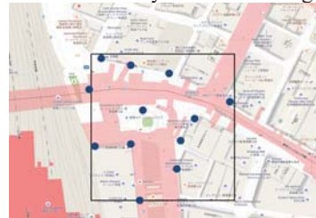
Fig. 1. Shinjuku, Tokyo, Japan (The region for study is 150m × 120m, bounded by the longitude interval [139.7039, 139.7056] and the latitude interval [35.6880, 35.6894])

user spots on a 1m × 1m square grid. Since it is difficult to collect the exactly realistic data at the current stage, we employ the ray-tracing channel data which is generated according to real propagation environment. Although the ray-tracing data is not as accurate as the realistic data, it provides at least an avenue to learn what we can harvest by using the new technologies. In our recent work [4], we had already used the same map to study the cellular network throughput performance based on 3.5 GHz ray-tracing data. In contrast, in this paper, we are primarily interested in the network throughput performance by using 28GHz ray-tracing data based on a variety of beamforming schemes.