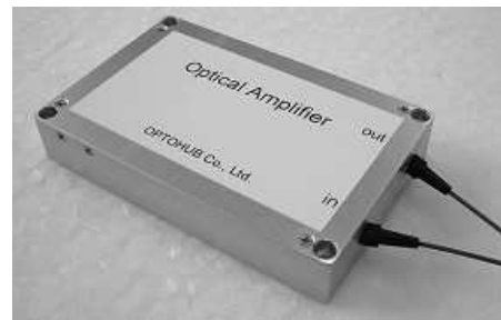
Fig. 2 Photograph of the EDFA module (Size: 45×70×12mm)

LD current alarm”, “EDFA module case temperature alarm” and” RS232 serial communication”. The RS232 interface functions are “set of output signal power”, “set of alarms threshold” and “read of monitor parameters values”. The electronics circuit consists of analog circuit for drive of LDs and a general-purpose microprocessor for monitors, alarms and RS232 communication. Those configuration and functions of the half MSA size EDFA module are same as a conventional MSA size EDFA module. For the package type of pump LDs uncooled mini-DIL and coaxial type are available, and for wavelengths of pump 980nm and 1480nm are available. Only in the case of bidirectional pump by using two 980nm LDs the remnant pump power should be paid attention because the remnant pump power come into the opposite side LD and may damages LD chip and make LD spectrum or power unstable. As for the EDF, conventional Si-EDF is adapted and the length is around 3m. We evaluate the half size EDFA module with 980nm forward pump of 150mW and 1480nm backward pump of 70mW, the output signal power of +18dBm is obtained at 0dBm the input signal power. The other characteristics and functions are shown in table 1. Fig. 2 shows the photograph of the half size EDFA module.