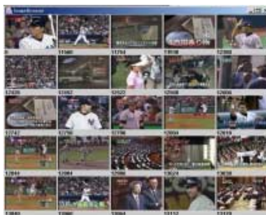
figure 6 integrating 2 image retrieval