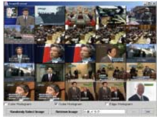
figure 3 multi keywords retrieval result

The retrieval speed is relatively high since all the images features are calculated in advance. In generally, it takes around 8 seconds to retrieve similar images from 45,000 images using any of images features, and it takes about 2 seconds to retrieve by one keyword input and 4 seconds by 2 keywords input and 6 seconds by 3 keywords.