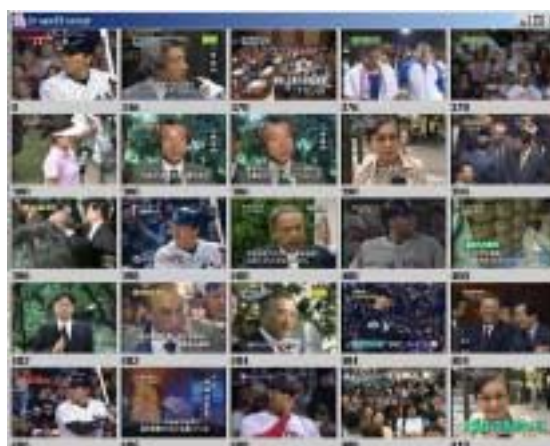
figure 5 integrating all 3 image features