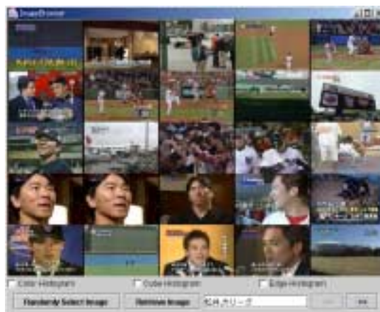
figure 4 retrieval results in 2 keywords