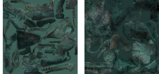
Fig.1 Texture files

range scanner and then edited by 3DS Studio MAX (Fig. 1).