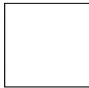
Figure 3. The Test image.