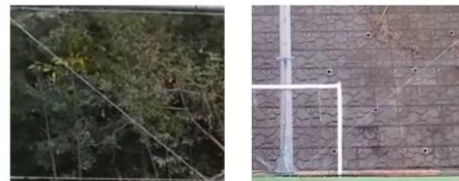
Fig.2 Dark background and bright background