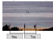
Fig. 3 Image of calibration experimental