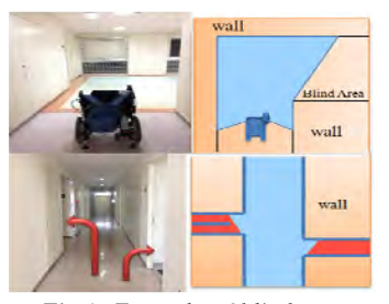
Fig 1. Example of blind area

user may feel discomfort because of uncertainty to face blind area. Thus, it is important to detect blind areas to ensure safe and comfortable navigation for the user.