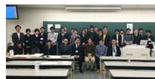
Fig.5 TK-2 Speakers with I-Scover Project members