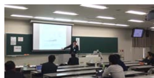
Fig.4 Paper Presentation in Session TK-2