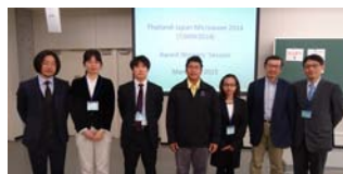
Fig.3 Speakers (Award Winners in TJMW2014) and Session organizers in Session CK-2