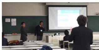
Fig.2 Question and answer after a presentation in Session CK-2 organized by IEICE Electronics Society