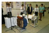
Fig.4 Demonstration of a book reading robot arranged by Prof. Seiichiro Kamata

training sequence (TS) with several advantages over CP, and the improvement of transmission performance degraded due to the frequency offset between transmitter and receiver, through the joint use of SC-FDE and spectrum combining. In his talk, the participants could learn the recent advances in SC frequency-domain signal processing and know the future perspective of high mobility wireless.