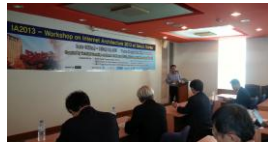
Fig.8 Conference IA2013