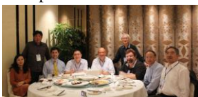
Fig.3 Organizers of IEICE Sponsored Lecture given by Prof. Tetsuya Ueda

His speech gave an overview of broadband wireless services in the near future. He referred to Cyclic prefix (CP)-inserted OFDM and single-carrier (SC) broadband signal transmissions which would take advantage of the channel frequency-selectivity to improve the transmission quality for broadband wireless services available even in a high speed train with severely doubly-selective channels, through the use of frequency-domain equalization (FDE). He referred to the frequency-domain filtered CP-SC signal waveform with an advantage of lower peak-to-average power ratio (PAPR) than CP-OFDM which would be advantageous in application to the cellular power limited wireless systems. He also referred to the