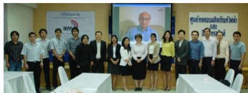
Fig.13 The participants in iEMAT 2013 Seminar

It was held on October 8-9, 2013. IEICE co-organized a seminar on Electromagnetic with iEMAT (Innovative EM Academy of Thailand) at PTEC, King Mongkut's Institute of Technology, Ladkrabang. The number of participants was 42. The young researcher including graduate students, academic staffs presented their papers and had a technical visit to EMC/EMI Center at PTEC. The research interests were electromagnetic theory, microwave engineering, antenna engineering, and EMC.