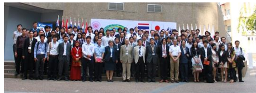
Fig.14 The participants in TJMW 2013

It was held on December 3-4, 2013. IEICE Bangkok Section served as a co-organizer of Thailand-Japan MicroWave (TJMW) since 2009. The TJMW 2013 was organized by Kasetsart University, Mongkut University of Technology, North Bangkok (KMUTNB) and Suranaree University of Technology (SUT). Total number of papers was 91 papers from Thailand, Japan, Indonesia, Vietnam, Algeria, Spain, India, Malaysia, and Myanmar. The two days program consisted of two Keynote Plenary Sessions, regular sessions and a young researcher session along with student poster session. The paper awards were presented to 4 Thai students and 4 Japanese students. The best paper awards supported the travel expense for Thai students to present papers at IEICE General Conference in Niigata, 2014. TJMW 2013 gained a lot of interest in many aspects such as technical exchange and promoted the activity of IEICE to young researchers in Thailand. There are 8 graduate students who joined IEICE by applying their membership in TJMW 2013.