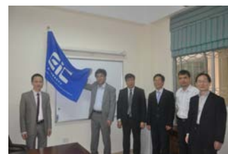
Fig.5 Commencement of IEICE Vietnam Section with Guest Speakers from Japan