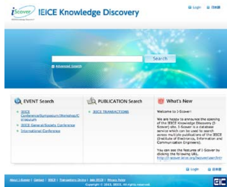
Fig.1 View of the top page