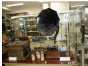
Fig.5 A well working set of Edison Standard Phonograph.

Hall 2 located upstairs exhibits the history of computers and audio equipment. You can experience the real operation of classical equipment on a large visual monitor so that students or