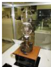
Fig.6 Exhibition of valuable Lieben Tube

Hall 6 exhibits electron devices including about 20,000 historical valves. The outstanding exhibition is the first diode in the world in 1904 called Fleming Valve, the famous triode invented by Lee De Forest in 1906, the transmitting tubes developed by Irving Langmuir in 1912-13, the photo multiplier applied to the neutrino observatory "Super-Kamiokande", with the