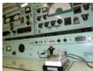
Fig.4 Reconstructed radio station in a vessel

experimental works in TIWC, for example, the spark type radio transmitter with short time discharge, valve type radio transmitter used in early days, radio equipment and radio navigation aids