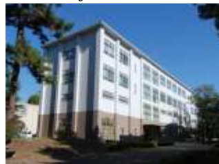
Fig.1 East-10 building in the campus accommodating the Museum

The Museum is located in East-10 building of UEC. The first and second floors of the building accommodate the Museum. The other floors accommodate the Advanced Wireless Communication Research Center. The layout of exhibition in the Museum is shown in Fig.2 and Fig. 3. The whole area of the Museum reaches around 820m 2 . The first floor has two big exhibition rooms and the second floor has five exhibition rooms.