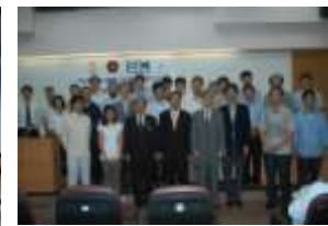
Fig. 7 Conference speakers and participants with the organizers