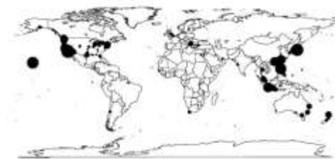
Fig.1 World earthquake map showing the East Japan Earthquake

collected incidents, they created a map in a form of texts, pictures and videos showing where and what happened. The main purpose