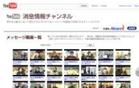
Fig.2 Example of the emergency information exchanged and shared through Youtube

YouTube is another example of the useful Web2.0 application in this situation. One of Japanese students studying in the United States was not able to contact her family in Japan via a traditional communication channel. Therefore, she kept monitoring data on the Net. Fortunately, she saw a clip on YouTube that captured her family staying safe there in Japan. This success came from collaboration between traditional media and digital media. Additionally, a special YouTube channel has provided the function of information exchange created by the victims through uploading their videos. Relatives and friends from all over the world can check them at the website (Fig.2).