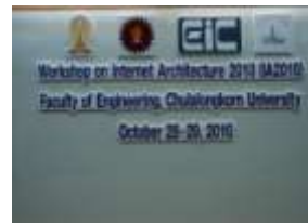
Fig. 4 Banner of Conference by IEICE Bangkok Section

(2) IEICE Special Seminar entitled "Advance in Next-Generation Network". It is co-organized by IEICE Japan.