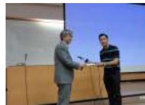
Fig. 6 Student Award giving ceremony