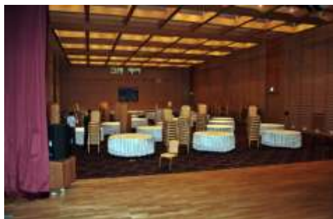
Fig. 3 Planning the floor for APNOMS 2009 in Jeju, Korea, 3 months ahead of the conference.

Remember if you have ever joined IEICE's Technical Committees during your PhD? It is likely that while your main affiliation is the university which would hire you, there is a good chance that you will also be strongly affiliated with a Technical Committee, especially organizing regular international conferences. If that happens, one day you may be put in charge of organizing an international conference. For example, Fig. 3 is one of the pictures I took on a trip to Jeju, Korea, where I was involved in organizing an international conference. Thus, I hope this essay will help you in your own future academic life.