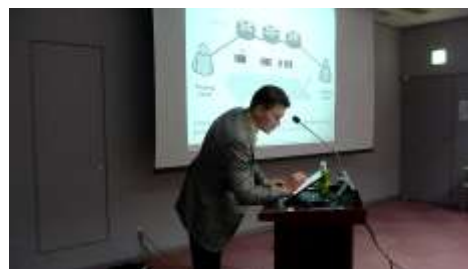
Fig. 2 A tutorial by the author on Active and Passive Network Performance Measurement at NOMS 2010 in April 2010.

Once you have graduated and had your master degree, next issue is that you should consider continuing your education in Japan. One very good reason is that the scientific research in Japan has several dozen years of history and is very mature today. The PhD program in GITS requires a PhD student to publish 2 peer-reviewed journal level papers to graduate and get the degree.