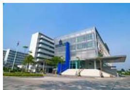
Fig.2 Evolving TNI

comprises three faculties and a department for graduate studies. The faculties are the faculty of engineering, the faculty of information technology, and the faculty of business administration. The number of enrolled students has been rapidly enlarged over the past three years and