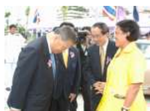
Fig.1 At Opening Ceremony of TNI (from right, HRH, myself, the former PM of Japan)

The new institute was named Thai-Nichi Institute of Technology to symbolize over the three decades of collaboration under strong mutual trust and respect between TPA and JTECS.