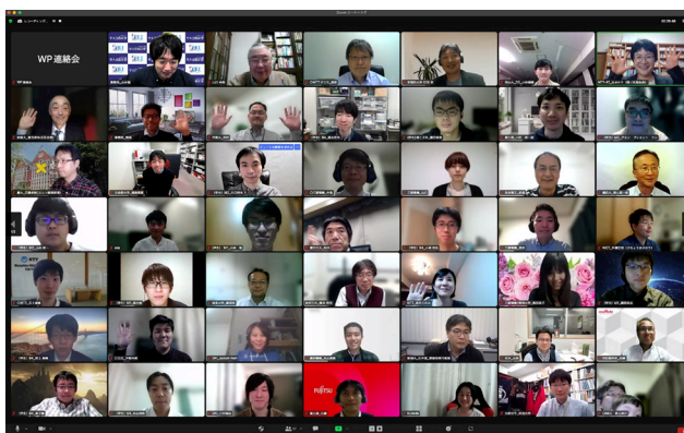
Fig. 1 Group Photo

The CS Welcome Party was successfully held with over 80 participants. The next Welcome Party will be held in March 2023 at the IEICE General Conference at Shibaura Institute of Technology in Saitama, Japan if the conference would hopefully be held in the conventional face-to-face style. We expect many people to participate in next Welcome Party. We would like to thank all participants, especially from companies, national institutes, Societies, Technical Committees, and Membership and Service Committee.