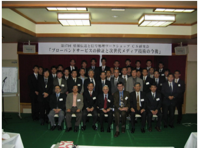
Fig. 2 All participants