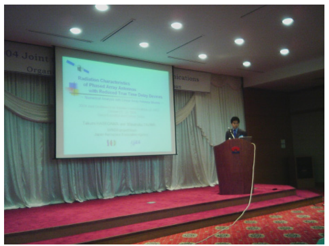
Fig. 2 JC-SAT2004 Podium

Inter Networking engineering test and Demonstration Satellite (WINDS), and so forth.