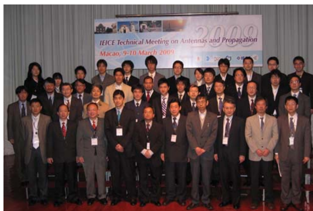
Fig.1 Oversea meeting in Macao in March

ISAP 2009 will be held in the imperial Queen's park hotel from October 20 to 23. The number of the submission is about 370. ISAP is held every year in one of Asian and Oceania countries. This year, many countries are contributing in the paper review. About 50 Japanese AP, EMT (electromagnetic theory) members are served as reviewers. The IEICE Transactions on Communications will publish "a special section on advanced technologies in antennas and propagation in conjunction with main topics of ISAP 2009" in October 2010. The editorial committee consists of AP members both from Thai and Japan. The deadline is on January 4, 2010. The detail can be found at the ISAP2009 web page ( http://www.isap09.org ). We are expecting many papers will be submitted to the special section.