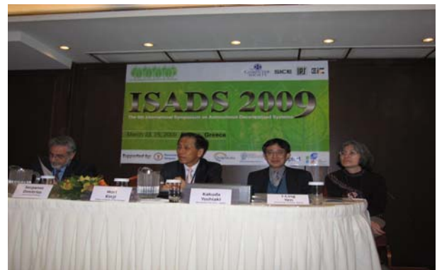
Figure 1 Opening