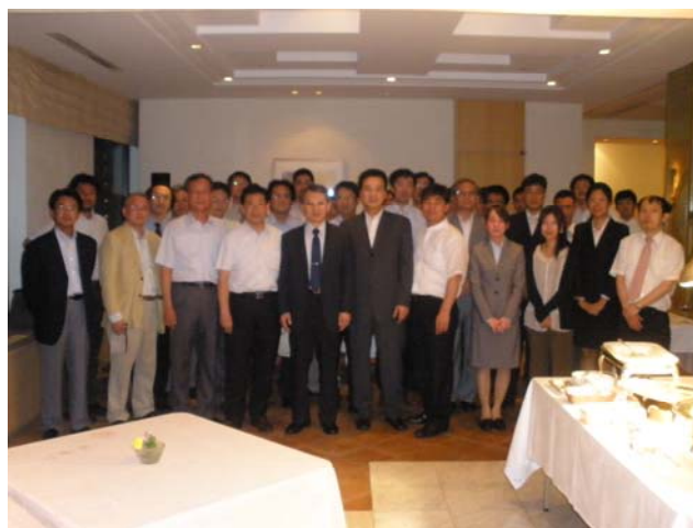
Fig.2 Meeting joining Korean AP members in July