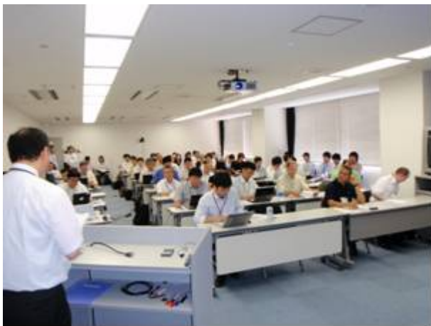
Fig. 2 Joint workshop with SDR Forum and SCC41