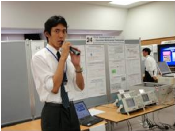
Fig. 1 Presentation at the technical exhibition

A welcome party was held after finishing the two-day technical conference. The number of attendees was about forty, which included members of the SDR Forum and the SCC41 from overseas (refer to Fig. 5). This enabled us to forge international relationships with the foreign authorities of the organizations concerned, which will be useful for the sharing and exchange of information.