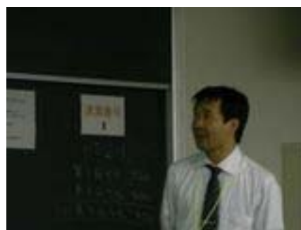
Fig. 1 Presentation by Prof. Ohnishi

Prof. Ohnishi introduced psychological effect of transmission delay on the performance of verbal conditioning. He explained that 300 milliseconds delay of reinforcement disturbed the conditioning and that meaningless words such like "Uh" decrease the effect on the conditioning. He also introduced psychological effect of transmission delay on haptic media. He showed that the delay of feed-back reduces the subjective impression of mass.