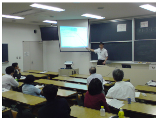
Fig.1 : Tutorial Session (BT-3)

Finally, as the organizer and chairperson of this session, I would like to express my appreciation to all lecturers and participants.