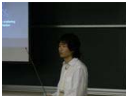
Fig. 5 Presentation by Dr. Motoyoshi

Dr. Isamu Motoyoshi introduced that the perception of some surface qualities uses shallow and simple computations based on simple statistics or features in 2-dimensional images. He explained his recent analysis which demonstrates that the perceived lightness and glossiness of a natural surface strongly depend on skew in the luminance histogram of the image. Demonstrations are conducted, which showed a simple re-mapping of the image luminance can dramatically alter the perceived material.