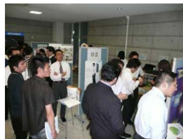
IEICE Global News Letter Editorial Staff