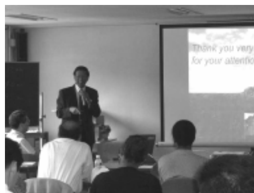
Fig. 2 Lecture.