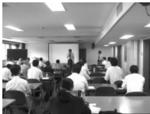
Fig. 1 Audience.

[1]Online[ http://www.ieice.or.jp/cs/abr/jpn/abr_ws_tt_20060801.htm ]