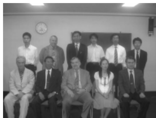
Fig. 3 All lecturers with the executives of the technical committee on ABR.