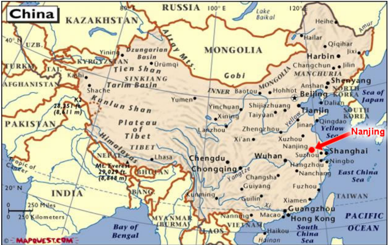
Nanjing locates in the east of China